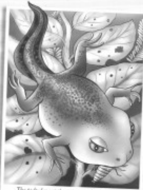
The tadpoles eat the insects in the pond.