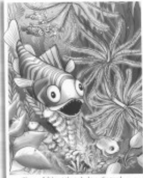
The small fish eat the tadpoles in the pond.