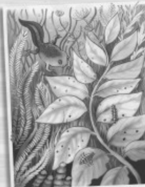
Insects eat the leaves of plants in the pond.