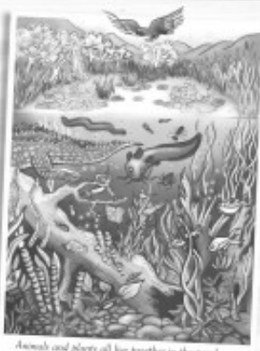
Animals and plants all live together in the pond.